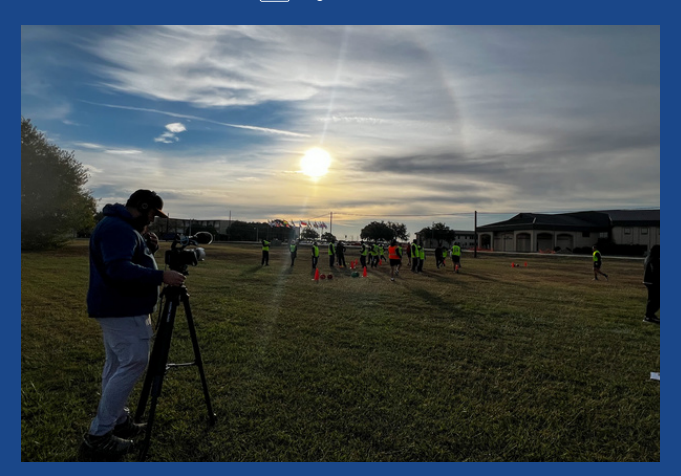
A photographer with Airman Magazine captures photos of international military students during a field exercise with the Inter-American Air Forces Academy at Joint Base San Antonio-Lackland, Texas, Nov. 15, 2022.