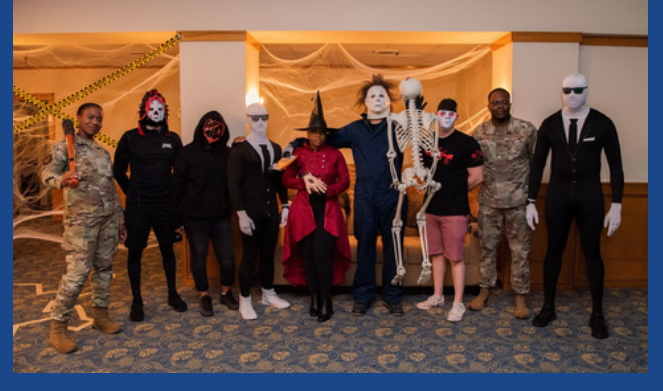
The 37th Training Wing 2022 Third Quarter Awards was held at Joint Base San Antonio-Lackland, Texas, Oct. 28, 2022. A group of 37 Training Group Airmen pose at Mitchell Hall after the event.